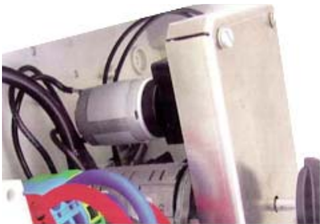
Motor drive 24V