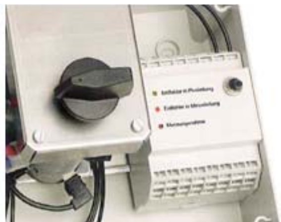
Electronic earth fault measurement