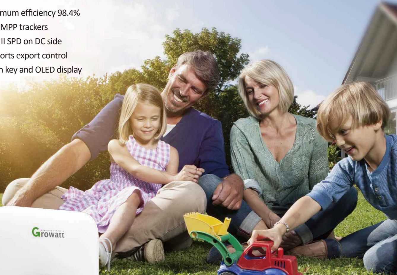
MIN 6000 TL-X efficiency