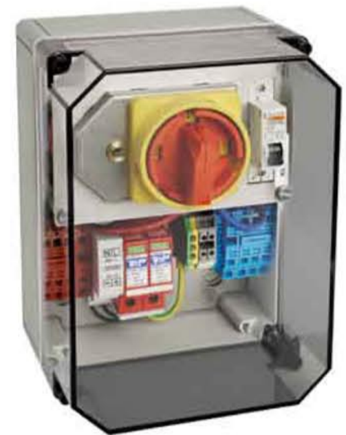
Motor driven DC disconnect switch