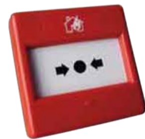
Fire alarm button (digital signal, pulse, NO or NC)