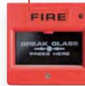
Fire alarm button Fire alarm button (digital signal, pulse, NO or NC)