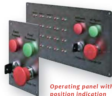
Operating panel with switch position indication