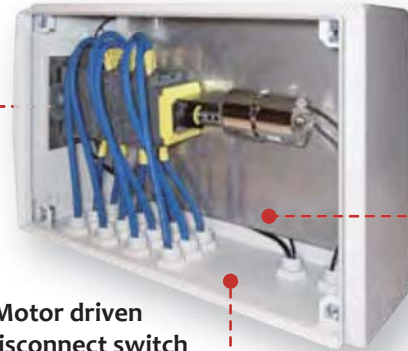
Motor driven DC disconnect switch