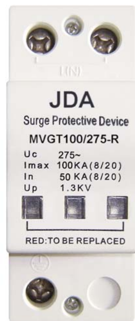
Dimensions and Diagram