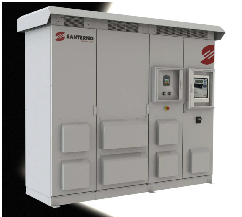
(Layout of Outdoor Version)