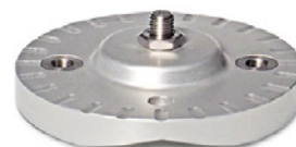
Figure 6 several mounting options are offered, such as this spring-loaded levelling mount for easy mounting, levelling and instrument exchanges on flat surfaces

For an overview of all SR15 versions and options, and how to order, please take a look at Table 1 on the next page.