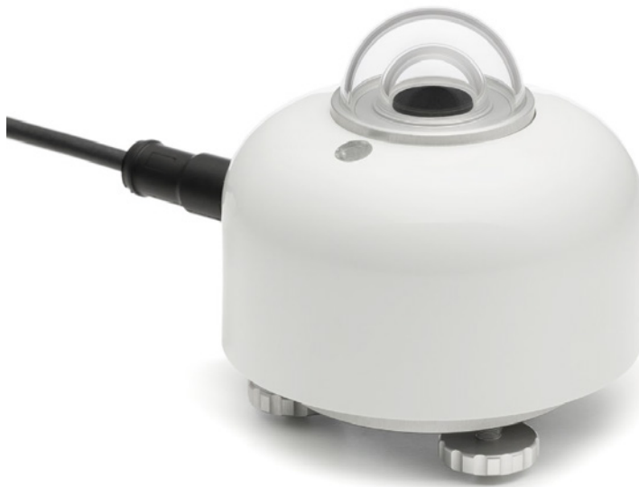
Figure 1 SR15 digital first class pyranometer series

SR15 digital pyranometer series is a range of high-accuracy digital solar radiation sensors. It is "first class" according to the WMO guide and ISO 9060:1990 standard and "Spectrally Flat Class B" in the 2018 revision. Version SR15-D1, equipped with an on-board heater, is compliant in its standard configuration with the requirements for "Class B" PV monitoring systems of the IEC 61724-1:2017 standard.