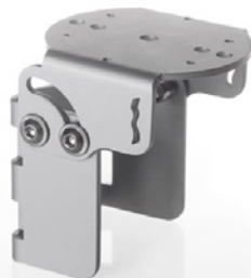
Figure 4 PMF01 mounting fixture accessory: practical, small footprint, and allowing horizontal and Plane of Array installations on various platforms

WMO, the World Meteorological Organization, recommends use of first class pyranometers such as SR15 for network operation.