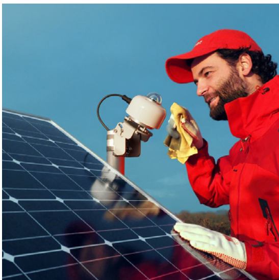
Figure 2 SR15 pyranometer mounted in PoA (Plane Of Array) on a mast for PV performance monitoring