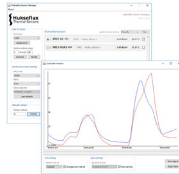
Figure 5 user interface of the Hukseflux Sensor Manager software

For communication between a PC and SR15 digital pyranometer series, the Hukseflux Sensor Manager software is included. It allows the user to plot and export data, and change the SR15 Modbus address and communication settings. Also, the digital outputs may be viewed for sensor diagnostics.