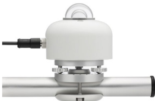
Figure 7 SR15 with optional tube levelling mount