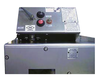
MiniPurge LC Back Plate