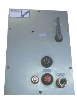
MiniPurge LC Panel Mount

1ZLC/__/_ (1YLC/__/_) 60 cu ft, 1.35 m<sup>3</sup> 2ZLC/__/_ (2YLC/__/_) 120 cu ft, 2.7 m<sup>3</sup> 3ZLC/__/_ (3YLC/__/__) 240 cu ft, 5.4 m<sup>3</sup>