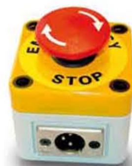
Emergency stop push-button (digital signal, pulse, NO or NC)