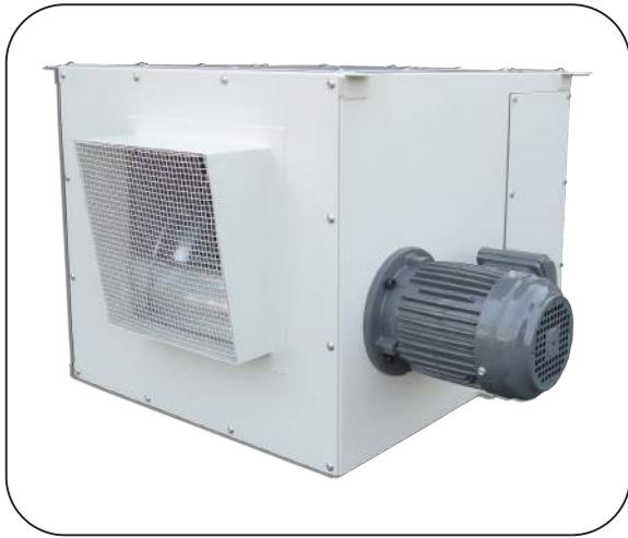
室內機 (參考圖) Indoor exhaust unit (split type, picture for reference only)