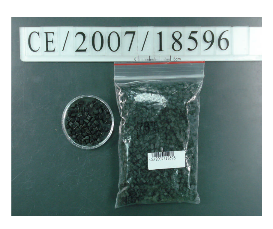
** 報告結尾 **

7TH FL., 301 SONG KIANG ROAD, TAIPEI, TAIWAN, R. O. C.