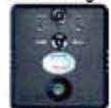
Charging, calibrating, data transfer