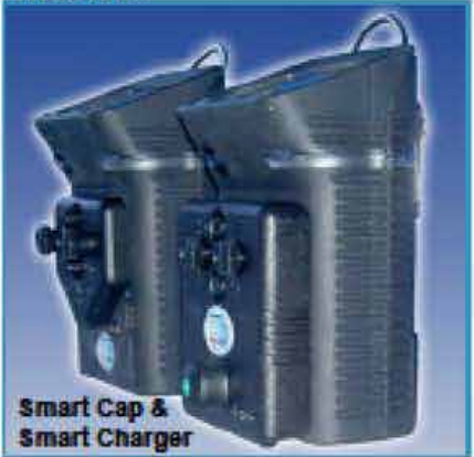
Smart Cap & Smart Charger

The optional data logger records gas concentrations and alarms over a period of 50 hours. These data can be transferred to a PC for evaluation and visualization.