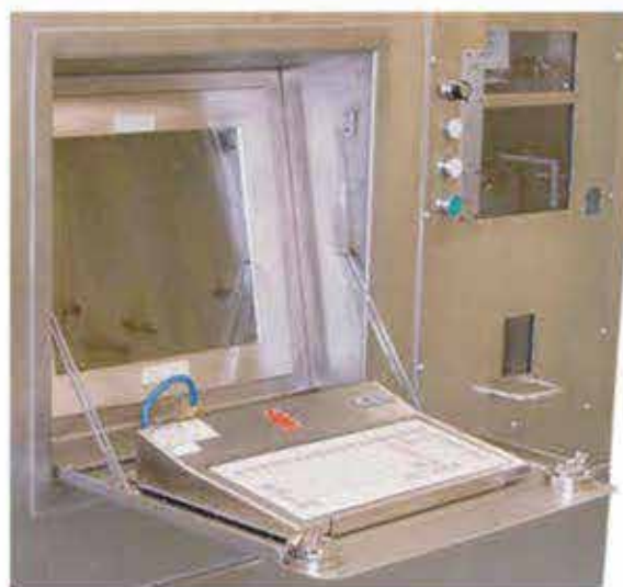
Model No AGE-DAT0-019 (AGE-DAT0-004 ADAPTED TO FOLD AWAY TRAY)