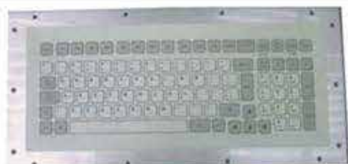
Model No AGE-DAT0-006