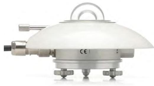
Figure 6 SR20-D2 side view.