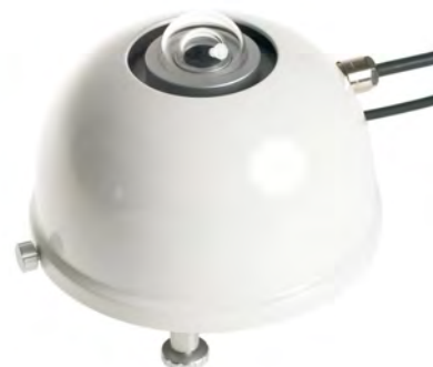
Figure 7 VU01 ventilation unit with SR20 pyranometer.