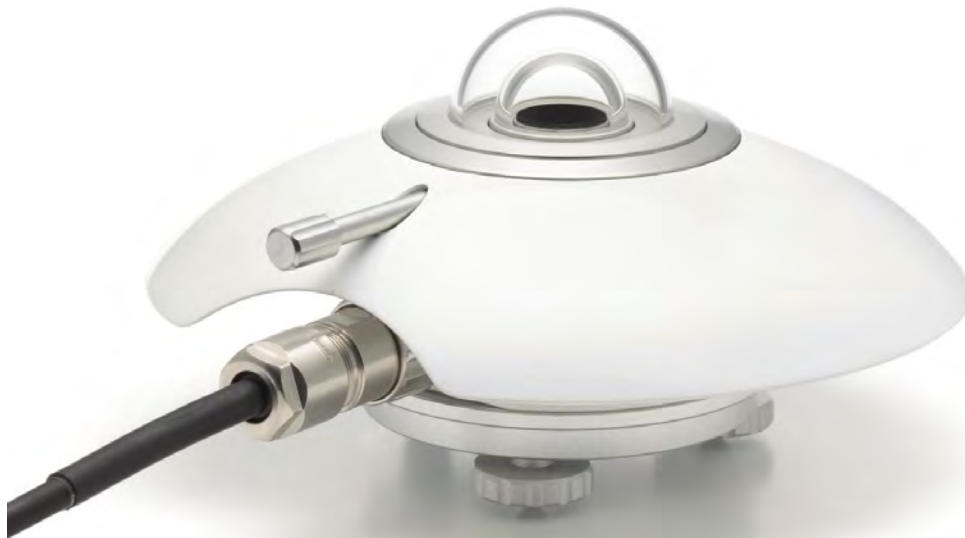
Figure 1 SR20-D2 digital spectrally flat Class A pyranometer.

SR20-D2 is a solar radiation sensor of the highest category in the ISO 9060 classification system: spectrally flat Class A. SR20-D2 is designed for the solar PV industry, offering two types of commonly used irradiance outputs: digital via Modbus RTU over RS-485 and analogue 4-20 mA (current loop). Pyranometer users prefer Hukseflux pyranometers for their unsurpassed measurement accuracy and their lowest total cost of ownership.