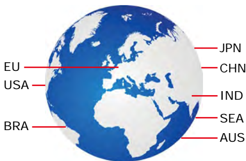
Figure 2 To reduce total cost of ownership: make use of the worldwide Hukseflux calibration organisation.