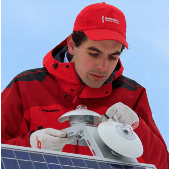
Figure 4 SR20-D2 Class A pyranometers with digital output for GHI (Global Horizontal Irradiance) and POA (Plane of Array) measurements.