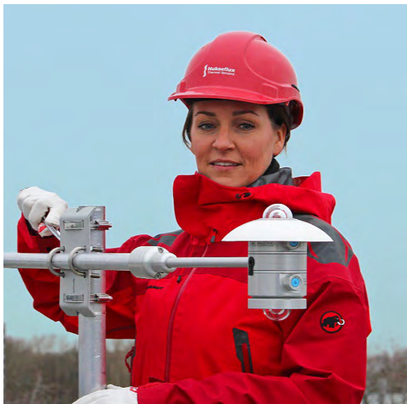
Figure 8 Installation of AMF02 albedometer mounting kit and two SR20 pyranometers, mounted with ALF01 level-ling fixture on a crossarm with crossarm bracket CMF01.